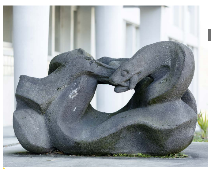
René Collamarini | Sans titre | 1969

Sans titre, a work funded by the 1% for art initiative, consists of two sculptures installed on either side of the entrance to the building, and illustrates the artist's aesthetic identity. The granite snakes are presented in a succession of interlocking planes and curves, that compel the spectator to circle around the work. This process, of which Collamarini is particularly fond, differentiates such sculptures from those where only the front bears any significance, the back imparting no additional meaning.