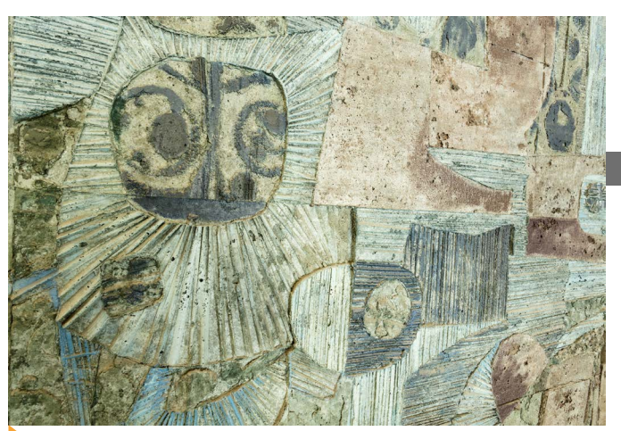
Jean-André Cante and Pierre-Noël Drain | Sans titre | 1967

The artists worked on different textures, creating resin pastes, smooth surfaces that look bumpy, and streaks. The latter are horizontal, vertical, diagonal or radiating. These abstract shapes interlock or overlay each other. The different textures, combined with the way the shapes have been set out, sometimes give rise to a foreground and a background, as can be seen on the right underneath the flight of stairs.