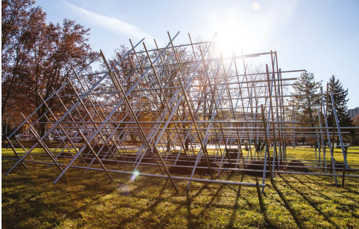
François Morellet | Sphère Enterrée | 1975