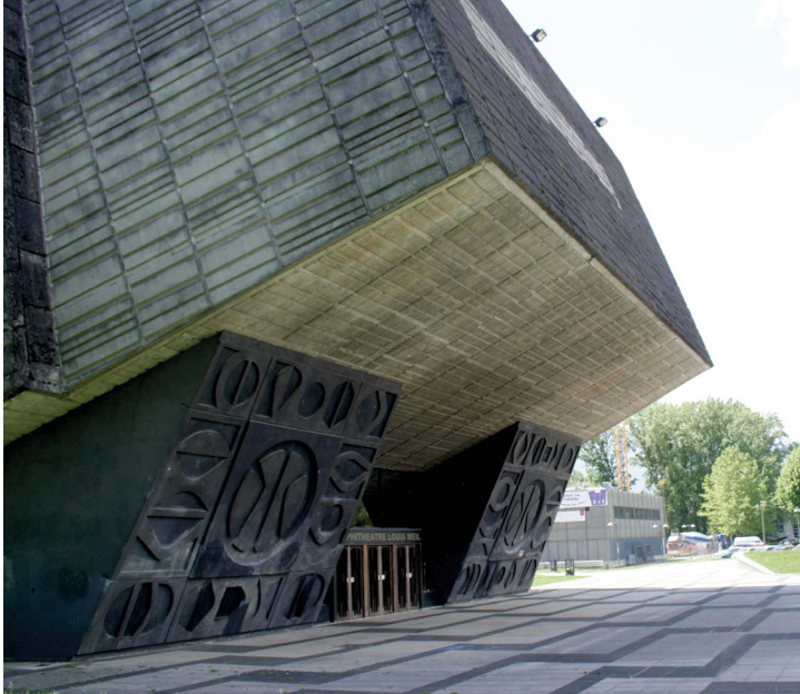
Edgard Pillet | Sans titre | 1969