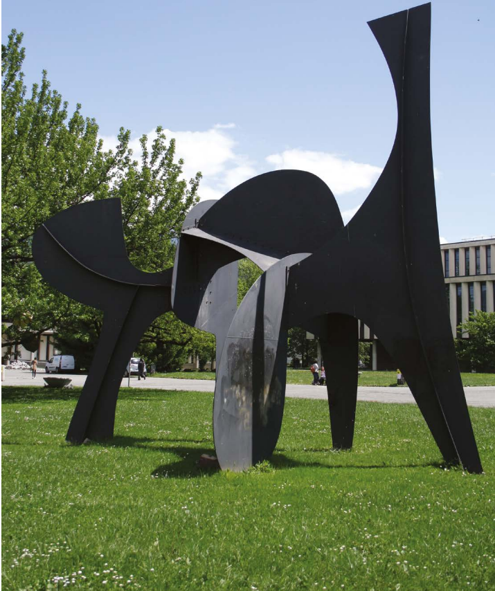
Alexander Calder | La Cornue | 1974

La Cornue has been positioned in front of the Bibliothèque Universitaire Droit - Lettres library. As the cost of the work exceeded the 1% initiative that was available, the artist donated the remainder, to the great delight of Maurice Besset, a close friend of Calder who was the curator of Grenoble museum at the time. La Cornue , a stabile (as opposed to mobile) work, consists of sheets of steel that have been assembled to form numerous planes, ridges and curves. Despite its monumental size, the installation's relatively minimal attachment to the ground makes it seem quite light. "The cat", as the work has come to be known by users of the campus, is a very powerful presence on the whole esplanade.