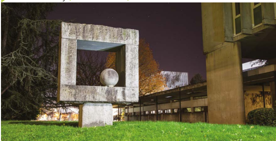
Pierre Székely | Point de Vue | 1971

The sculptor, architect and philosopher Pierre Székely turned to monumental art very early in his career. Works by this prolific artist can be seen in numerous countries and many of the world's capital cities. In 1983, he created Le Monument à la paix (Monument to Peace) , which he gave to the city of Budapest, and L'Oiseau Impossible (The Impossible Bird) , a gift to the State of Israel from the French president, François Mitterrand. Székely was awarded an honorary doctorate by the Royal Academy of Art in the Hague; in collaboration with a company called Air Liquide, he invented a process for sculpting granite with a blowtorch. This technique makes it look as though the stone has been naturally shaped by erosion.