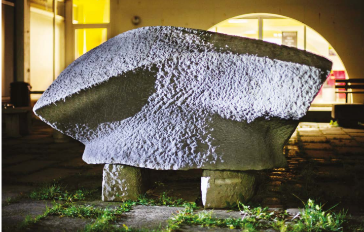
Morice Lipsi | L'Adret | 1967