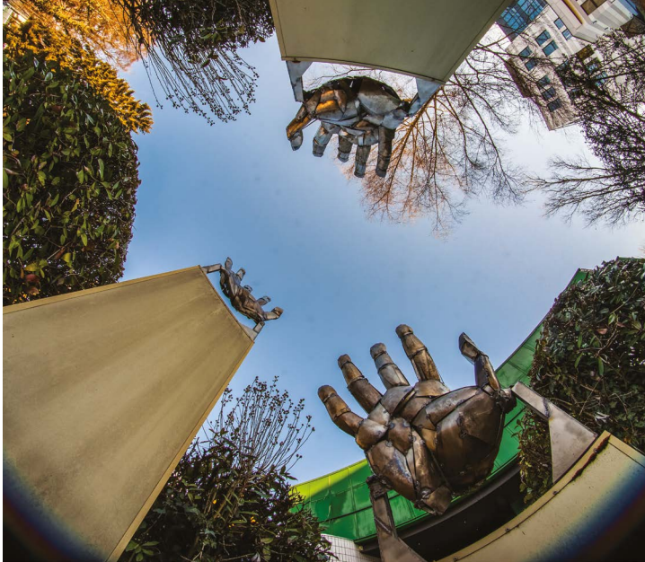
Olivier Descamps | Sans titre | 1990