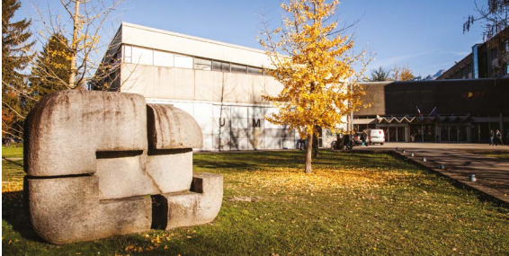
Pierre Székely | Front | 1971

The sculptor, architect and philosopher Pierre Székely turned to monumental art very early in his career. Works by this prolific artist can be seen in numerous countries and many of the world's capital cities. In 1983, he created Le Monument à la paix (Monument to Peace) , which he gave to the city of Budapest, and L'Oiseau Impossible (The Impossible Bird) , a gift to the State of Israel from the French president, François Mitterrand. Székely was awarded an honorary doctorate by the Royal Academy of Art in the Hague; in collaboration with a company called Air Liquide, he invented a process for sculpting granite with a blowtorch. This technique makes it look as though the stone has been naturally shaped by erosion.